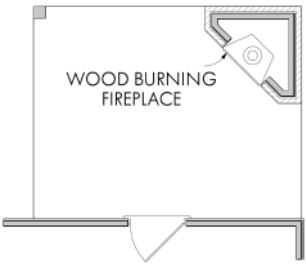
GAME DAY PORCH OPTION